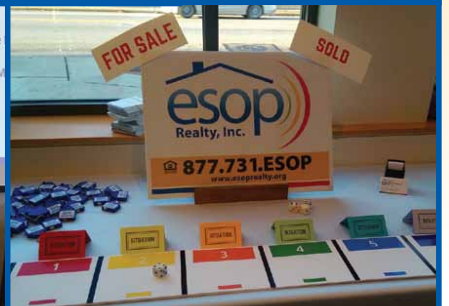
ESOP Realty Board Game at the Social Venture Partners Cleveland bigBANG! event, November 2015