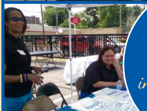
Glenville Event, June 2016