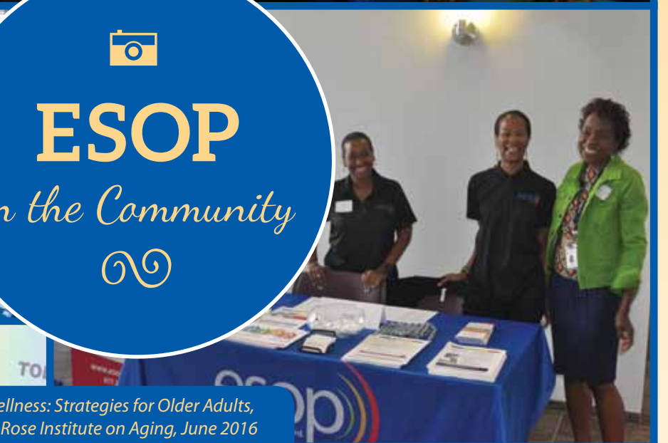
Financial Wellness: Strategies for Older Adults, at Benjamin Rose Institute on Aging, June 2016